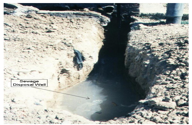
Fig. 2 Sewage disposal well in hard rock containing shallow aquifer in Gulshan colony.

Conclusions and Recommendations: The results of water samples analyzed for coliform and faecal coliform bacteria indicate high level of bacterial contamination in the study area. In all the samples from shallow aquifer the contamination level has crossed the recommended limits of WHO (1984).