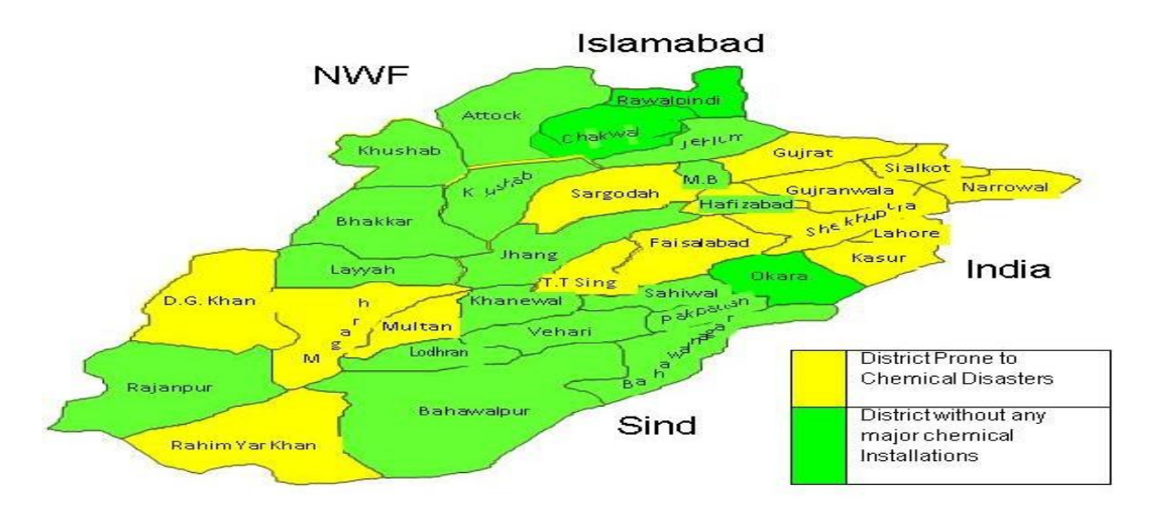
Figure-3 Identification of Chemical Disaster Prone Districts in Punjab

potential to be effected by Technological Disaster and road accidents involving releases of toxic chemicals and gases. Figure-3 illustrates districts having potential of industrial development and can likely be affected by technological disasters whereas Table-3 describes district wise detail of human settlements having potential to be effected by technological disasters.