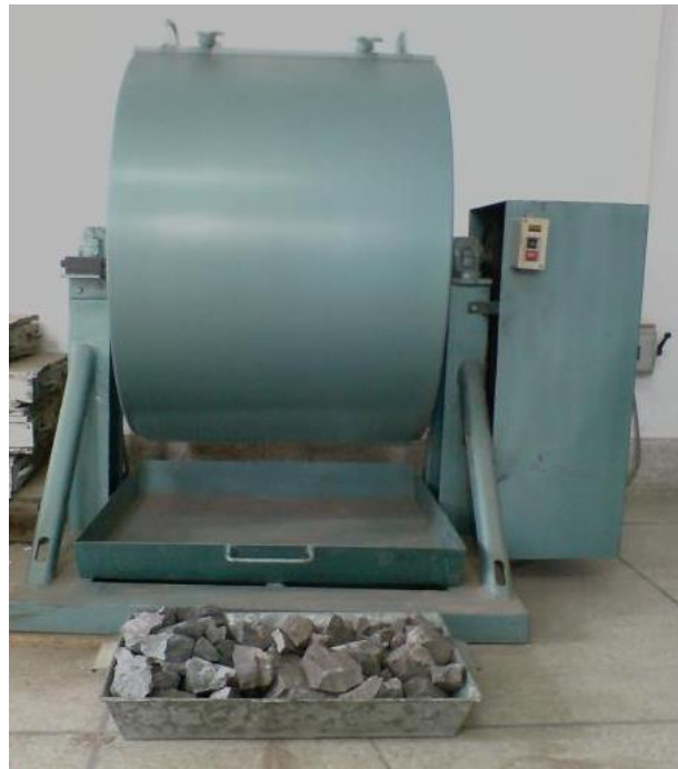
Figure 1. Los Angeles abrasion machine used for determination of abrasion of the rock aggregate

After completion of 500 rotations the material was sieved through 1.7mm sieve and the passed fraction was expressed as a percentage of the total weight of the sample which is called Los Angeles abrasion value. The shape and size of the aggregate was changed after completion (Fig. 2).