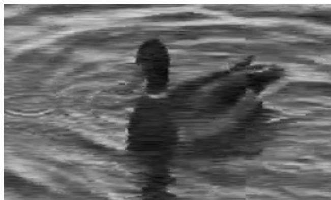
Fig-3: Window of luminance component of High Definition DUCKS TAKEOFF Frame 4 encoded at 5.7 Mbps (a) without deblocking filter (b) with deblocking filter